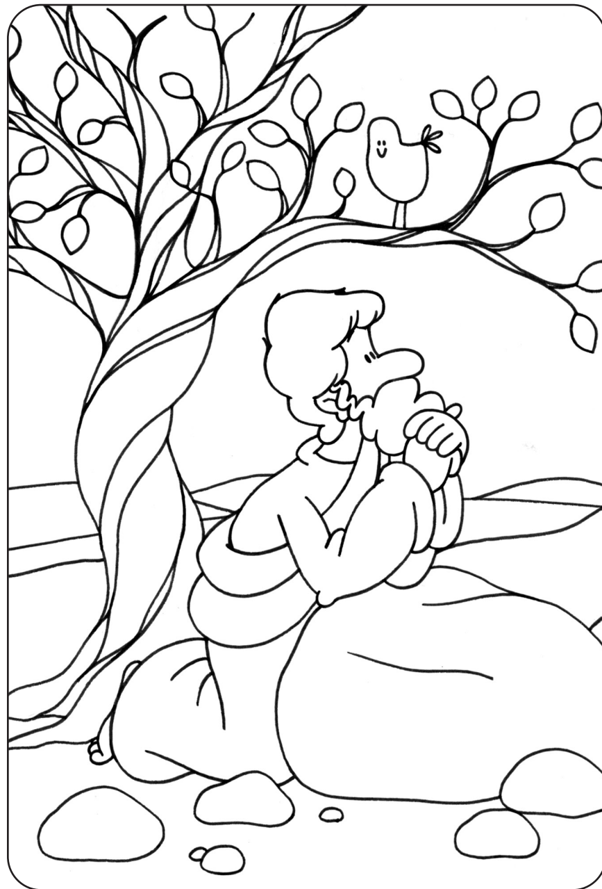
Jesus was praying in a certain place.