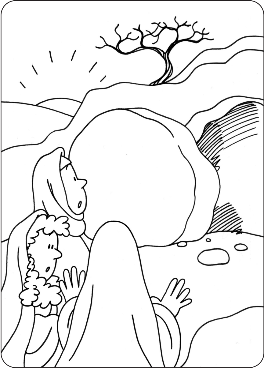
They found the stone rolled away from the tomb.

Permission to copy granted for one-time use on April 20, 2025, only.