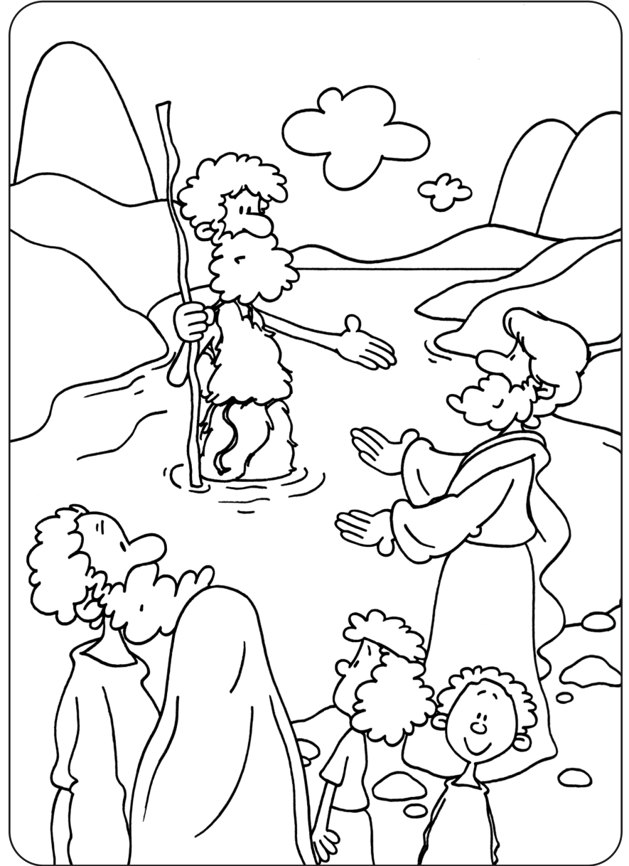
He will baptize you with the Holy Spirit and fire.