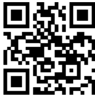
Use this QR code to pay with a credit card

New this year: You can purchase a special VIP golden ticket for $20 for access to a VIP cookie selection opportunity at 8:30am on Saturday, December 14 th . VIPs will be paired with a personal cookie shopper to design a customized box. We also will be offering 5 golden tickets for VIP taste testers who are willing to join us on a bake day in December. Contact Katrina Drinnon at katrinadrinnon@gmail.com or 618-975-8361 to learn more.