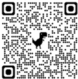
Use this QR code to order

Would you like to have a variety of Christmas cookies without the hassle of making them all yourself? Do you like to give scrumptious homemade gifts over the holidays? St. Paul's Youth Ministry is selling boxes of two dozen assorted Christmas cookies for $15. Please complete the enclosed order form and place it in the collection plate or return it to the church office no later than Sunday, December 8th . Also this year, you can order and/or pay online using these QR codes.