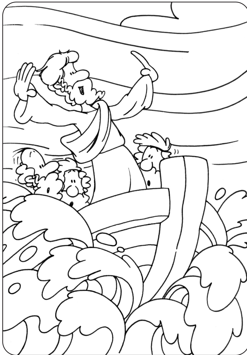
He awoke and rebuked the wind and said to the sea, "Peace! Be still!" Mark 4:39