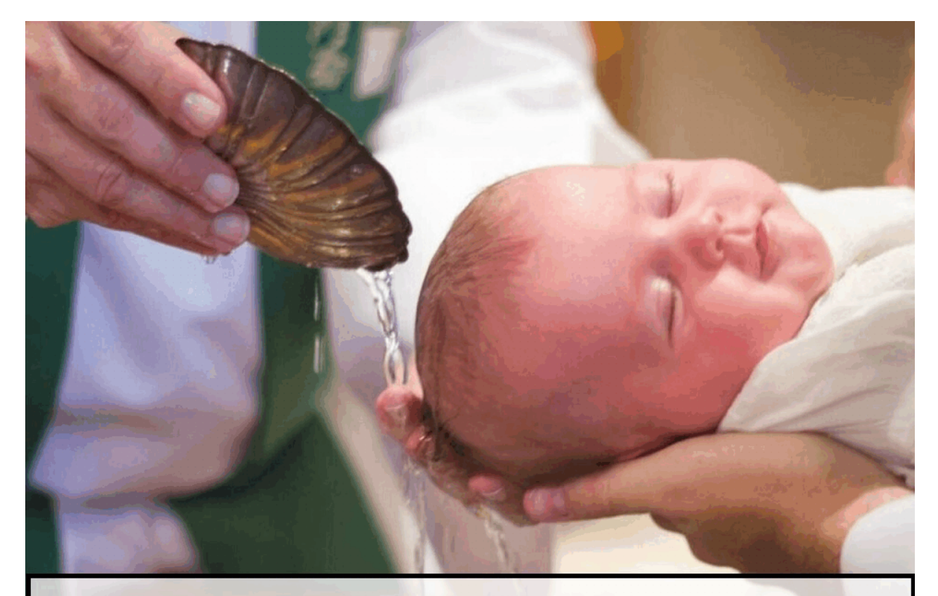
The same power that raised Christ from the dead is living in you. Romans 8:11

"Changing Lives through Worship, Compassion, and Christian Education."