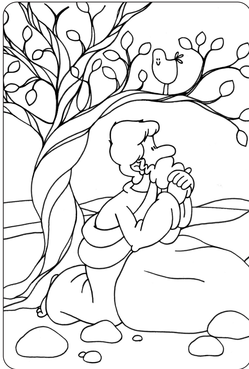
Jesus was praying in a certain place.